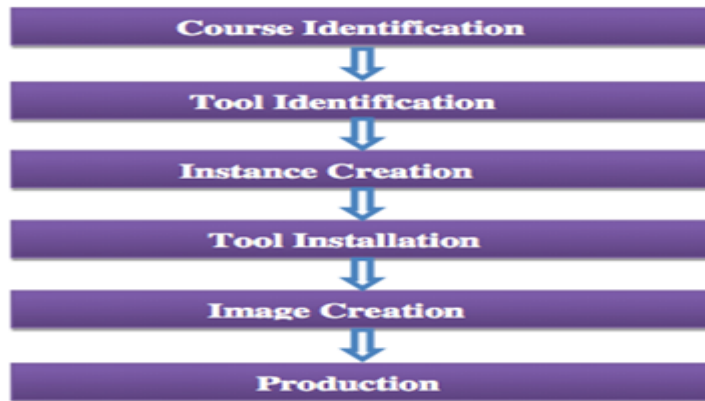
Figure-2. Guidelines in implementing software engineering tools on cloud [1]

In addition, benefits of cloud computing usage are visualized through working on multiple computers and operating systems with regardless of time and location. In addition, universities will have top beneficiaries and this able to optimize the resources more efficiently. To conclude, cloud computing have indulge in many areas weather in education or industry and would have benefited users through quality improvement and providing guidelines in implementing the tools in cloud which also indirectly cause benefit to the society.